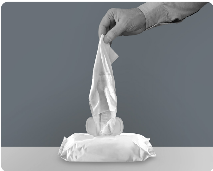
Dispensing wipes produced with current technology