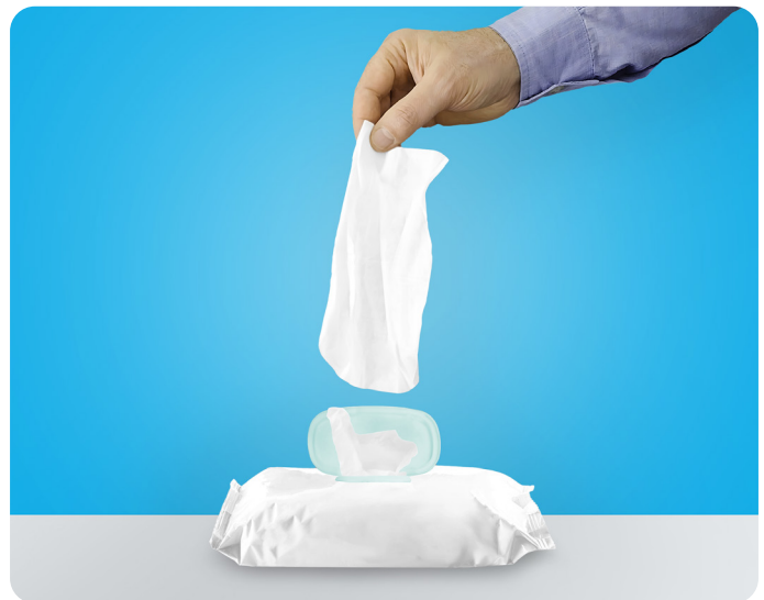
Dispensing wipes produced with Vertis-RI