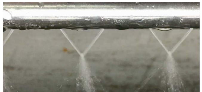
The fluid management system enables efficient cleaning over the full plate width.

Since the FlexoCleanerBrush is fully automatic, there is no operator contact with moving parts, press nip points or chemicals. You can rely on a safe cleaning operation.