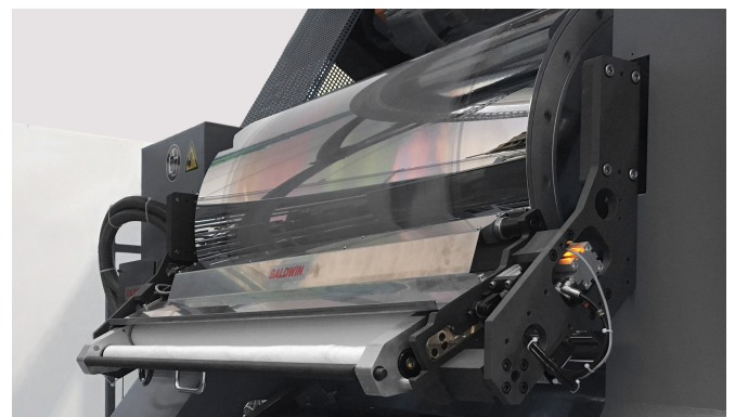
FilmCylinderCleaning installation in a film extrusion production line.

The cleaning system removes traces and deposits from the cylinder surface that may occur during the film extrusion process. A special long lasting lint-free microfilament cleaning cloth, the Baldwin FilmPac, absorbs the dirt and fluids from the cylinder surface without risk of scratching it – ensuring a continuous production with a consistent high film quality.